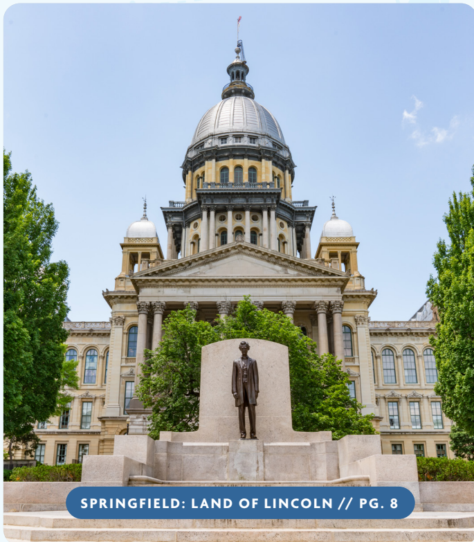
SPRINGFIELD: LAND OF LINCOLN // PG. 8