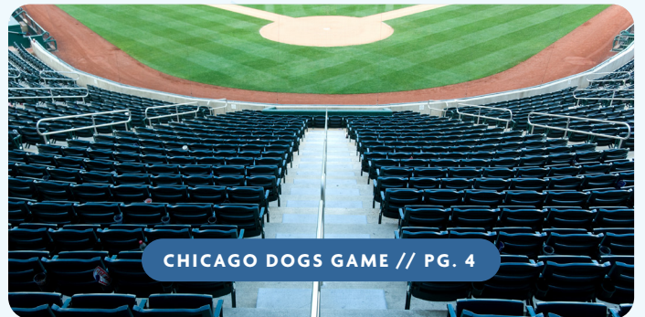
CHICAGO DOGS GAME // PG. 4